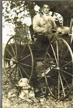
To the right: He was undoubtedly brave and bold and curious. Here he is in the outdoors from his custom buggy with his trusty dog along side for company.