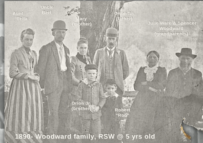
1890 - Woodward family, RSW @ 5 yrs old